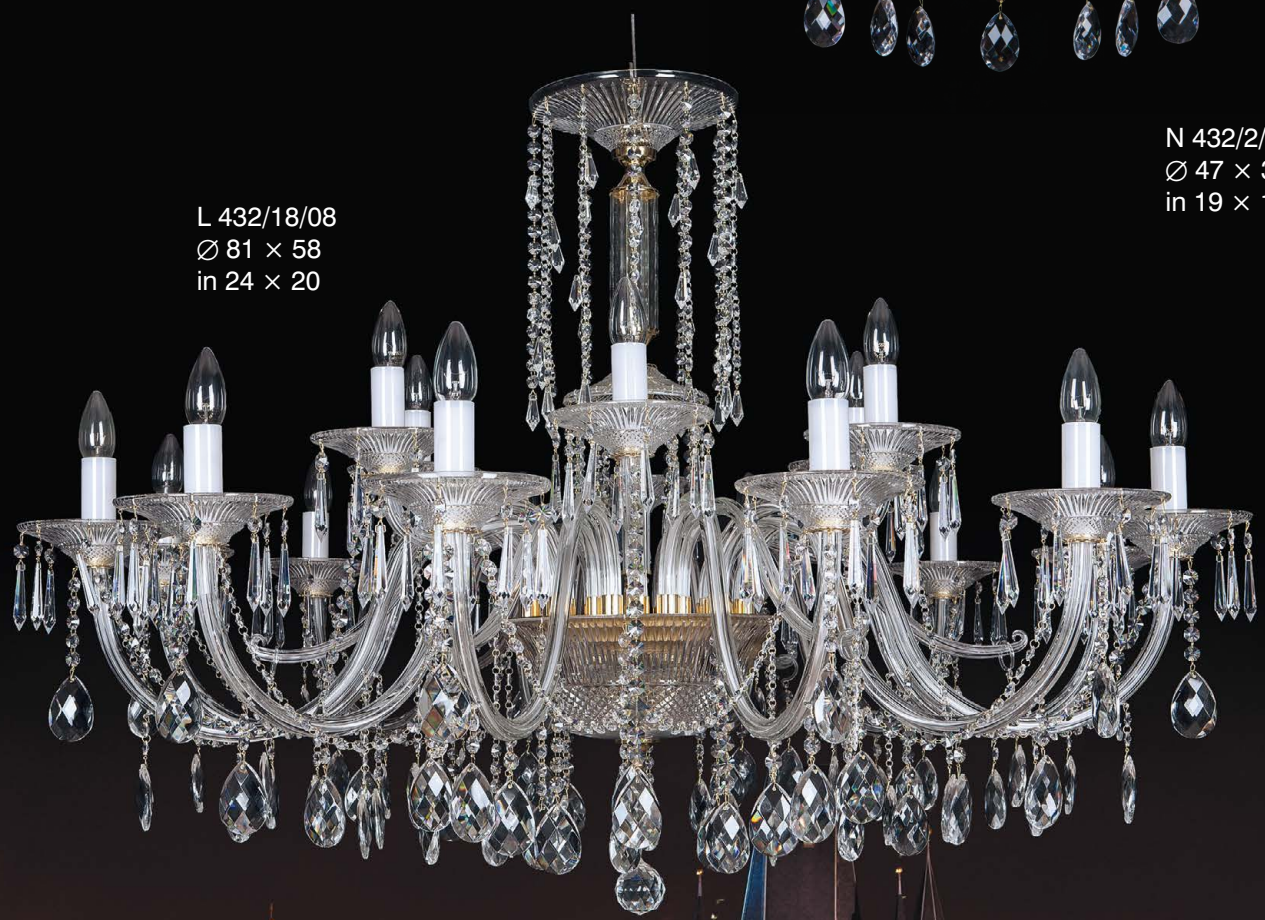
L 432/18/08 Ø 81 × 58 in 24 × 20