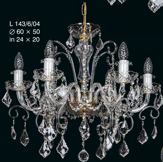
L 143/6/04 Ø 60 × 50 in 24 × 20