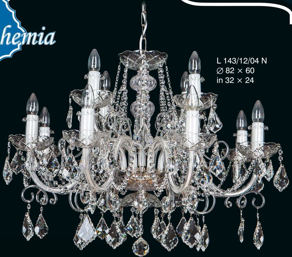
L 143/12/04 N Ø 82 × 60 in 32 × 24