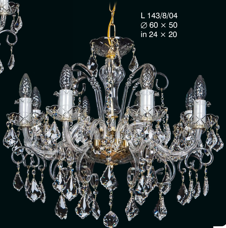
L 143/8/04 Ø 60 × 50 in 24 × 20