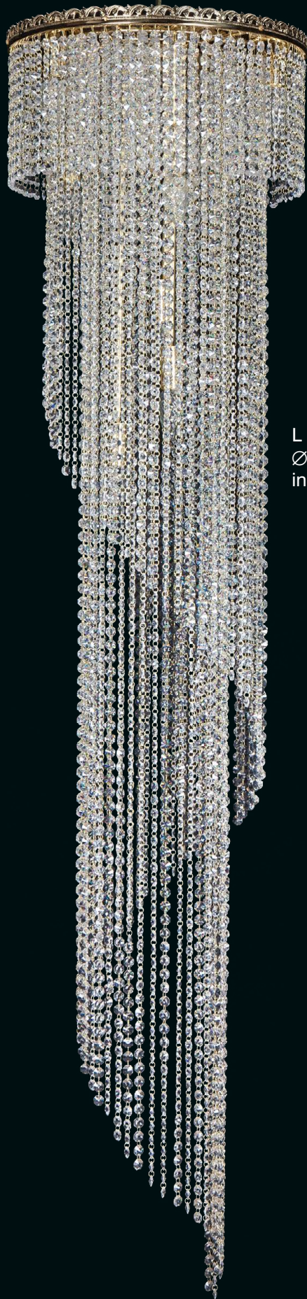
L 746/10/05 Ø 40 × 170 in 16 × 67