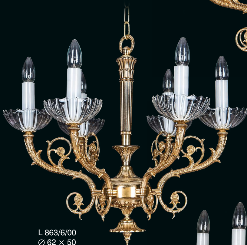
L 863/6/00 Ø 62 × 50 in 25 × 20