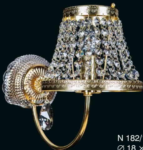
N 182/1/05 Ø 18 × 28 in 7 × 11