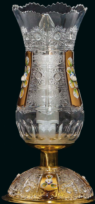
S 687/1/00 Ø 13 × 25 in 5 × 10