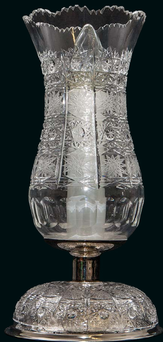
S 683/1/00 Ø 13 × 25 in 5 × 10