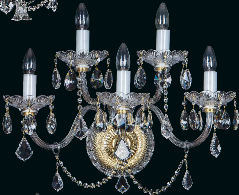
N 744/5/02 Ø 57 × 42 in 23 × 14