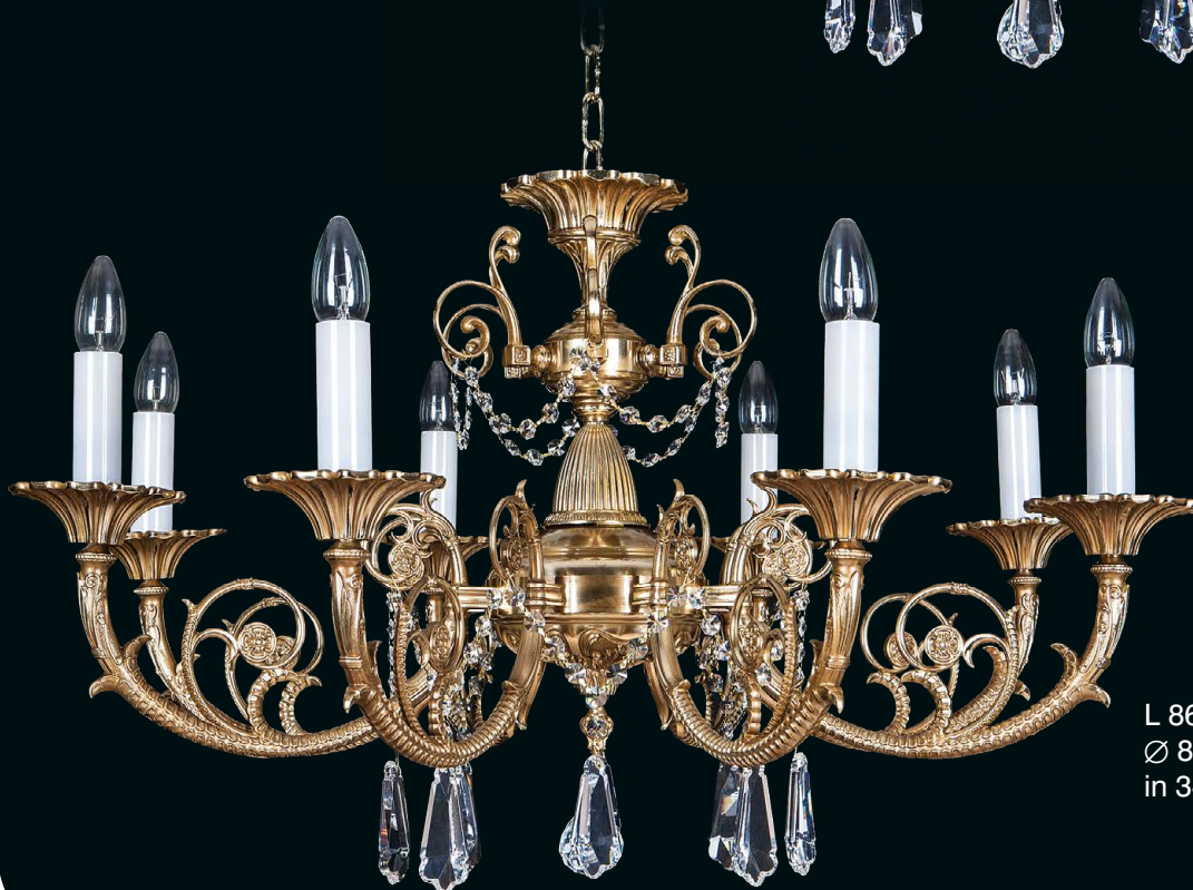
L 861/8/091 Ø 86 × 50 in 34 × 20