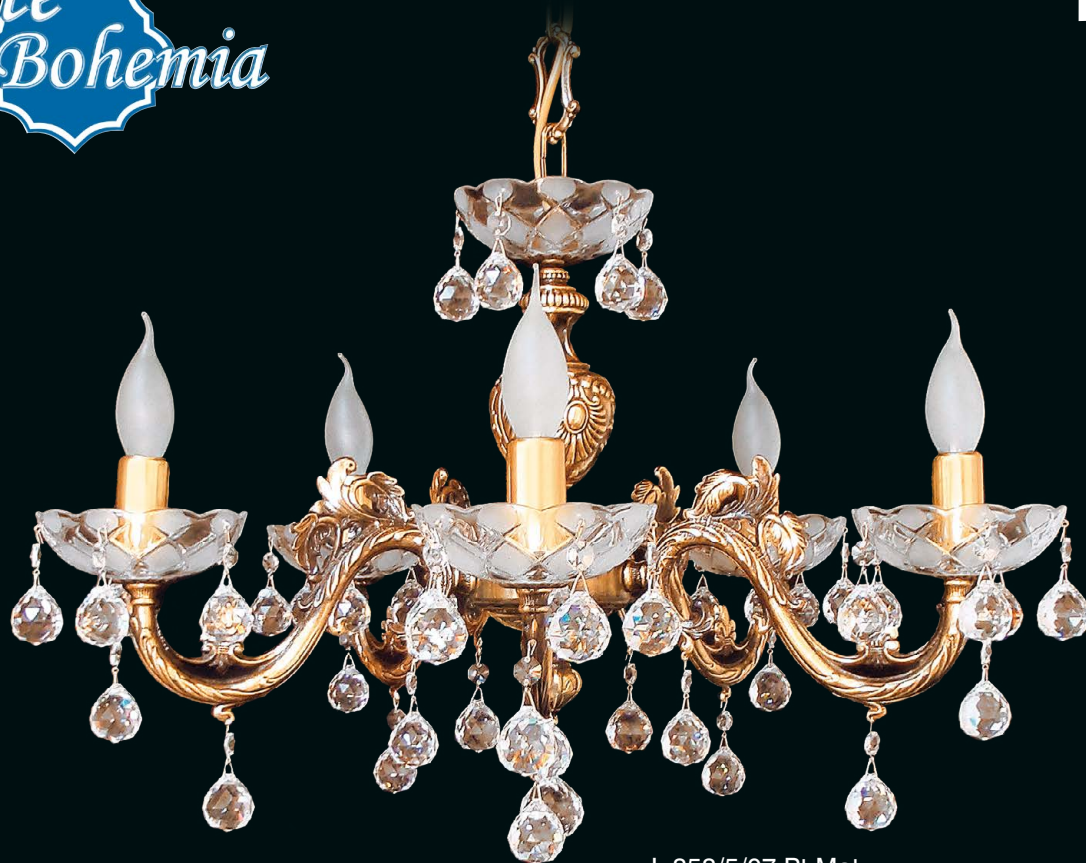
L 858/5/07 Pt Mat Ø 61 × 42 in 24 × 17