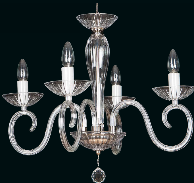
L 224/4/024 N Ø 57 × 47 in 23 × 19