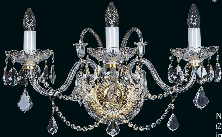
N 744/3/02 Ø 51 × 31 in 20 × 12