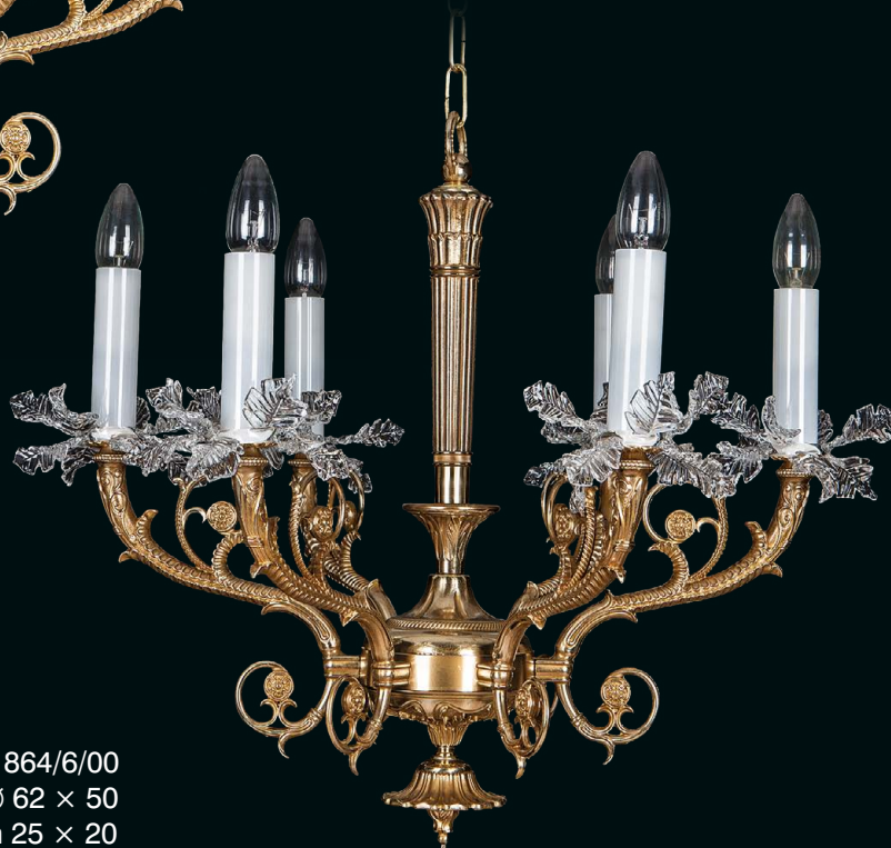
L 864/6/00 Ø 62 × 50 in 25 × 20