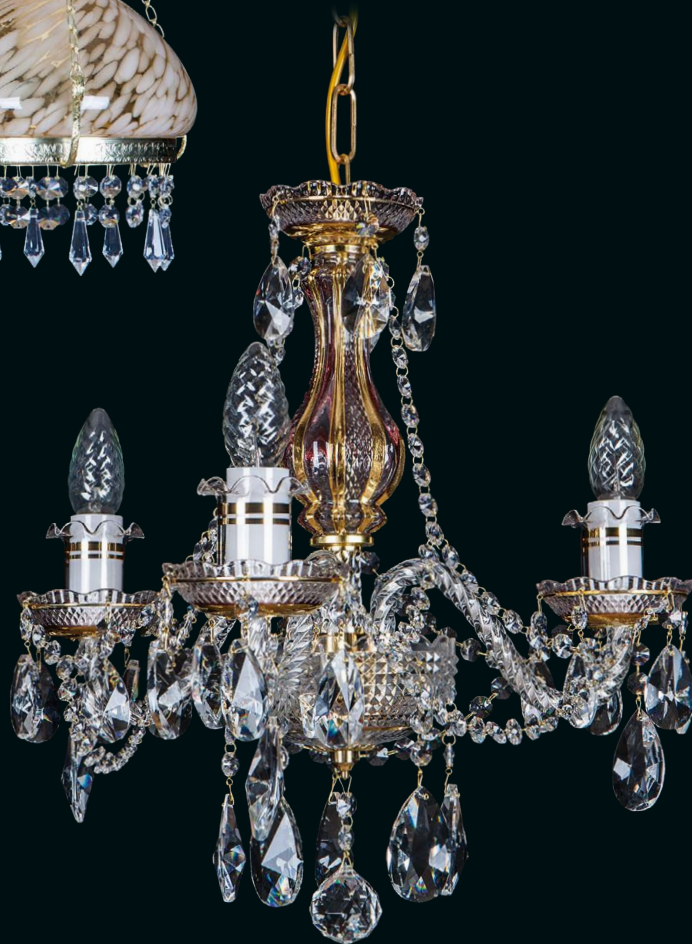
L 180/3/02 Zi Ø 43 × 43 in 17 × 17