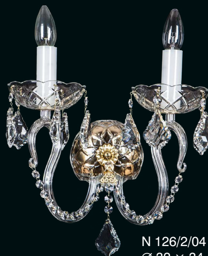
N 126/2/04 Ø 32 × 34 in 13 × 14