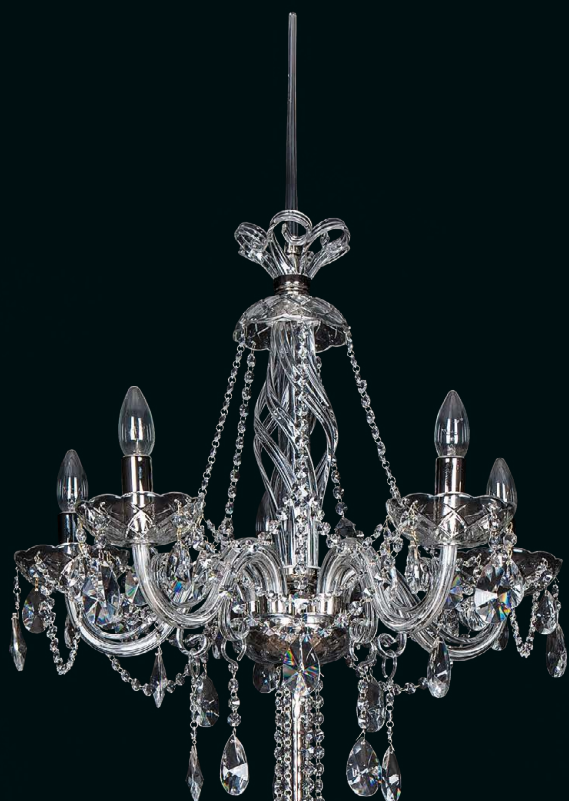
S 415/5/02 NK Ø 58 × 176 in 23 × 69