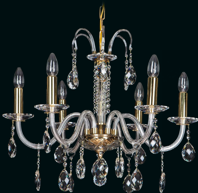
L 217/6/01 Ø 63 × 49 in 25 × 19