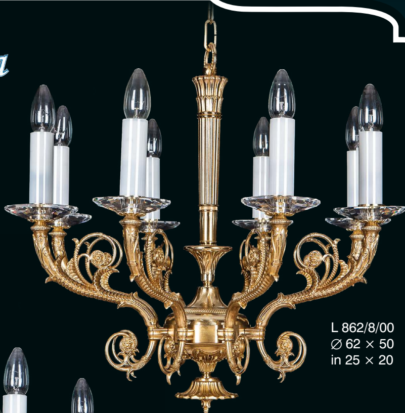
L 862/8/00 Ø 62 × 50 in 25 × 20