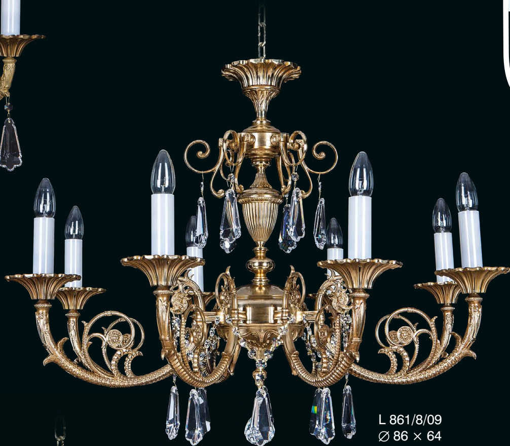
L 861/8/09 Ø 86 × 64 in 34 × 25