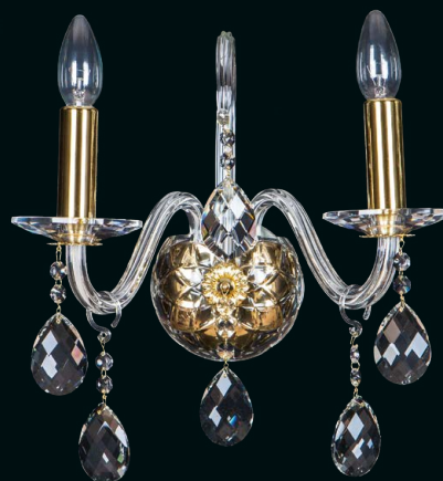
N 217/2/01 Ø 36 × 34 in 14 × 13