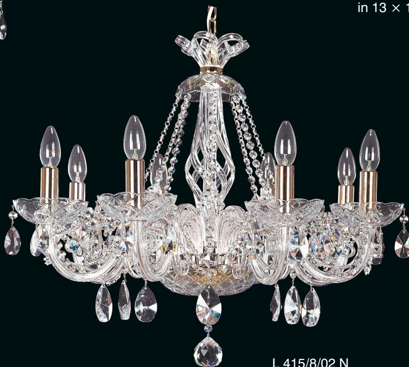
L 415/8/02 N Ø 70 × 57 in 28 × 23