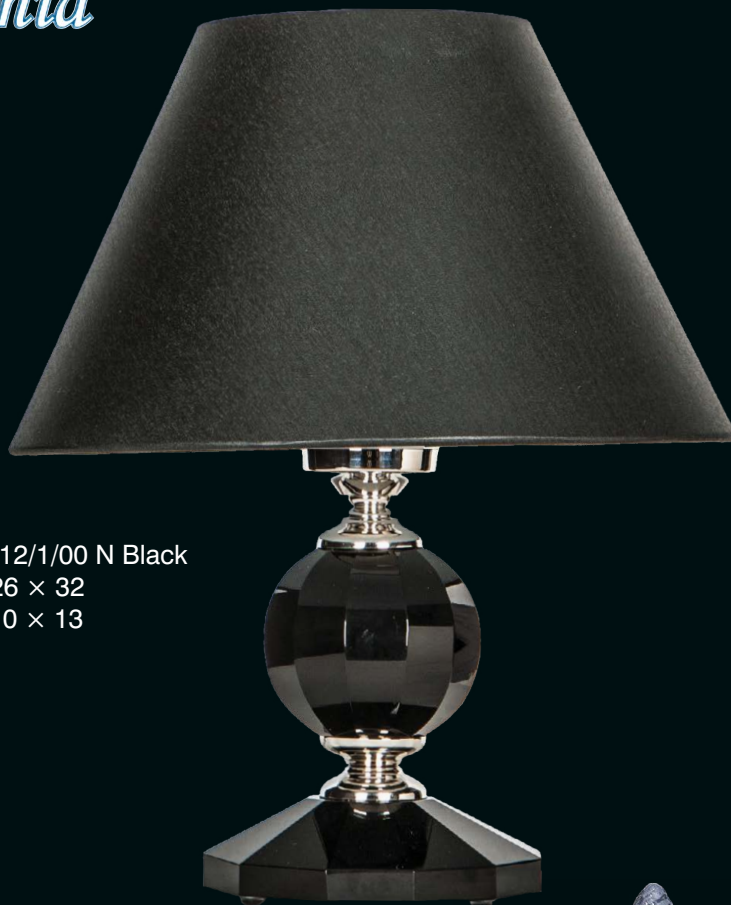
S 212/1/00 N Black Ø 26 × 32 in 10 × 13