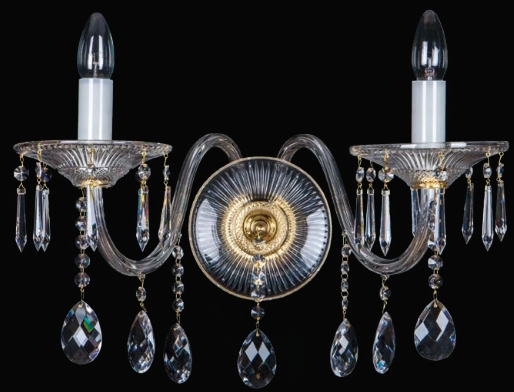
N 432/2/08 Ø 47 × 35 in 19 × 14