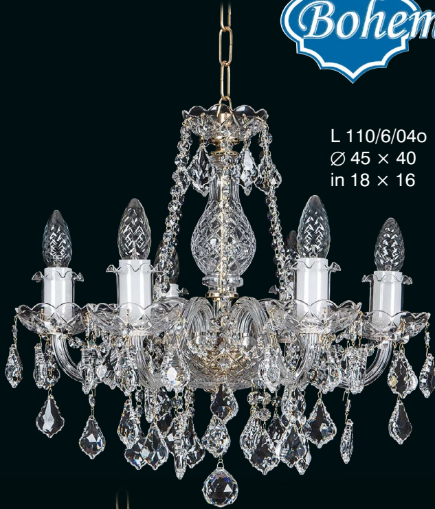
L 110/6/04o Ø 45 × 40 in 18 × 16