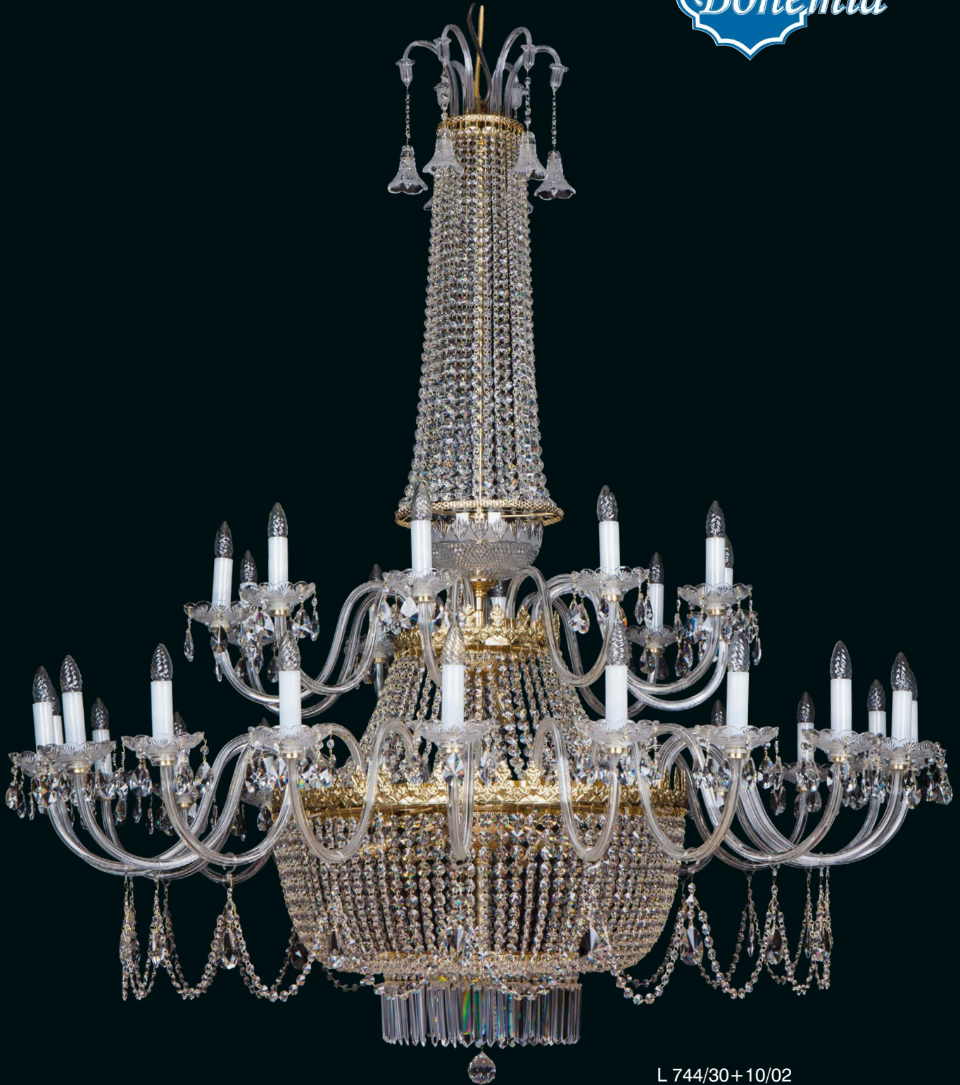
L 744/30+10/02 Ø 160 × 180 in 63 × 71