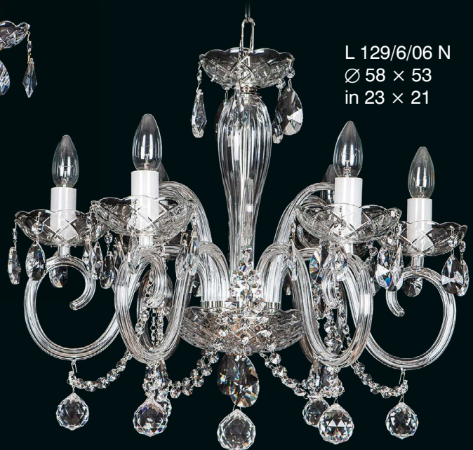
L 129/6/06 N Ø 58 × 53 in 23 × 21