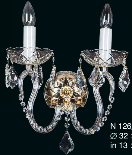
N 126/2/04 Ø 32 × 34 in 13 × 14