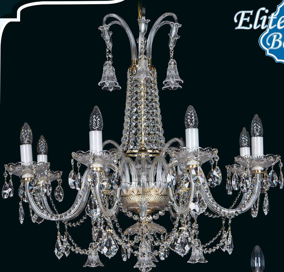
L 744/8/02 Ø 82 × 77 in 32 × 30