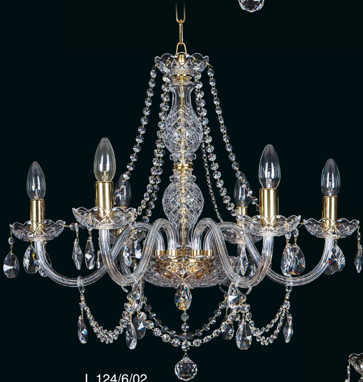
L 124/6/02 Ø 63 × 58 in 25 × 23