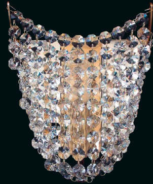
N 711/2/05 Ø 16 × 20 in 6 × 8