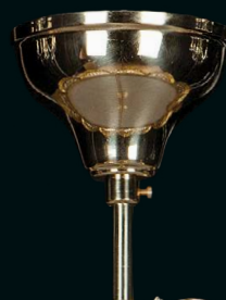
L 728/3/05 Ø 35 × 23 in 14 × 9