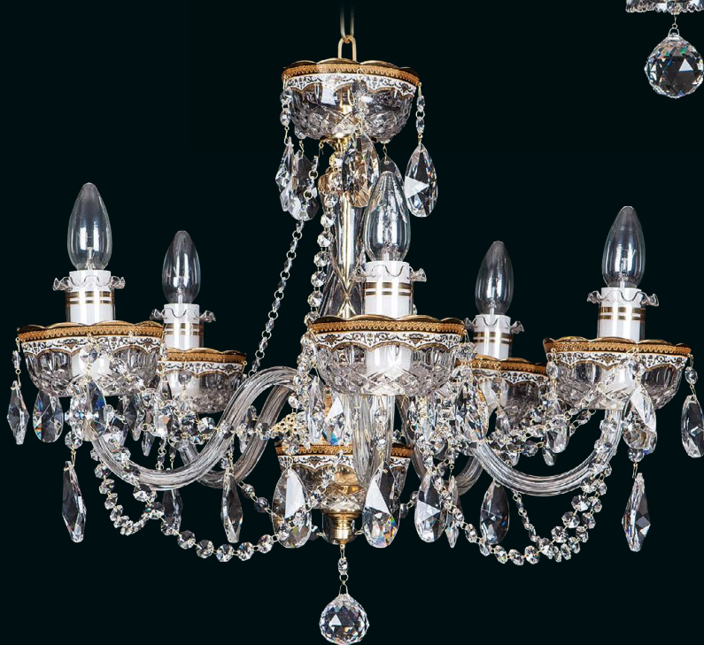
L 645/5/02 Ø 55 × 47 in 22 × 19