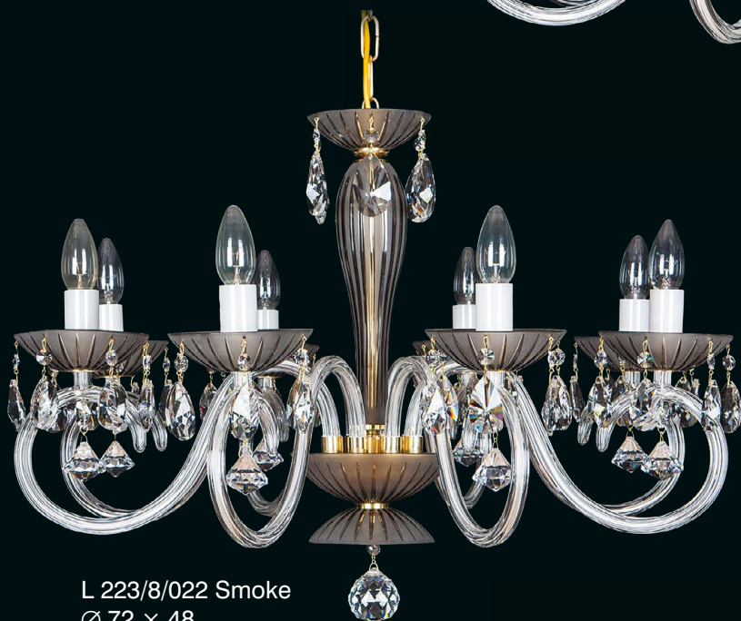
L 223/8/022 Smoke Ø 72 × 48 in 28 × 19