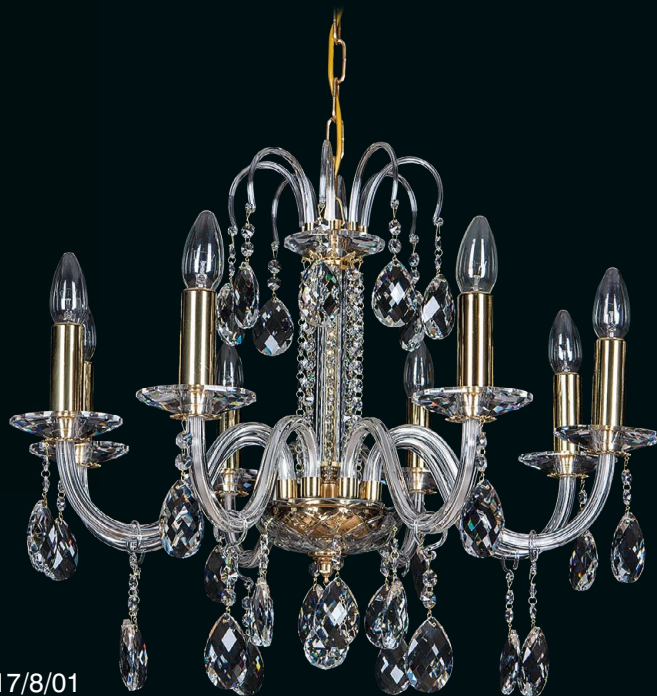
L 217/8/01 Ø 63 × 49 in 25 × 19