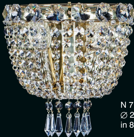
N 712/2/05 Ø 21 × 22 in 8 × 9