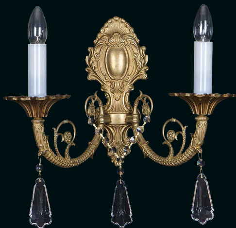
N 861/2/09 Ø 42 × 38 in 17 × 15