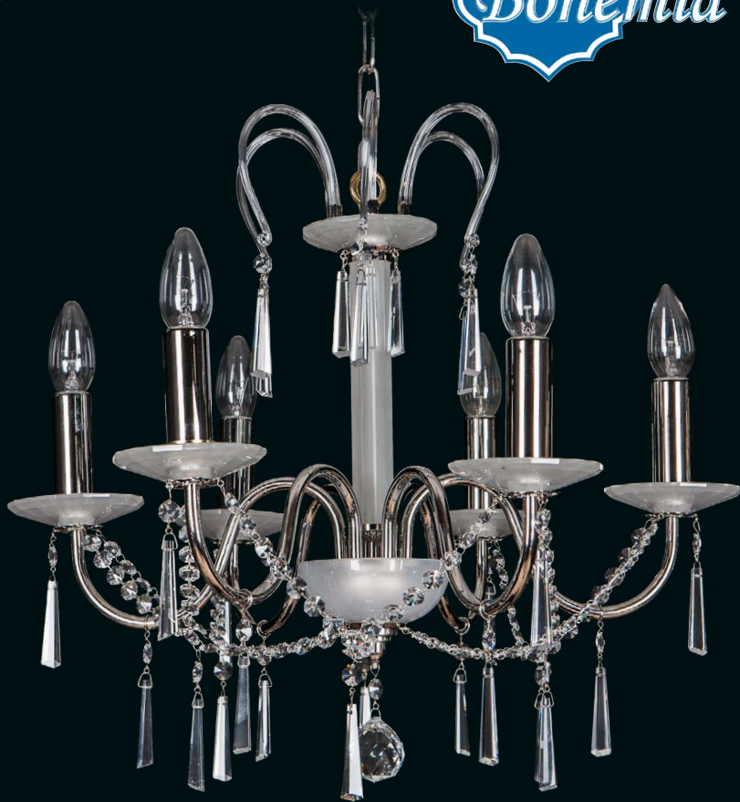
L 921/6/03 N Mat Ø 53 × 50 in 21 × 20