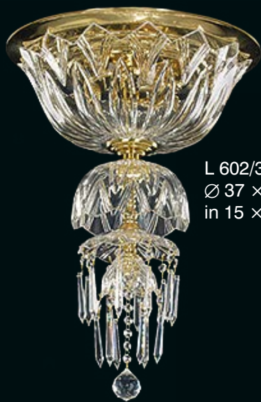
L 602/3/19 Ø 37 × 51 in 15 × 20