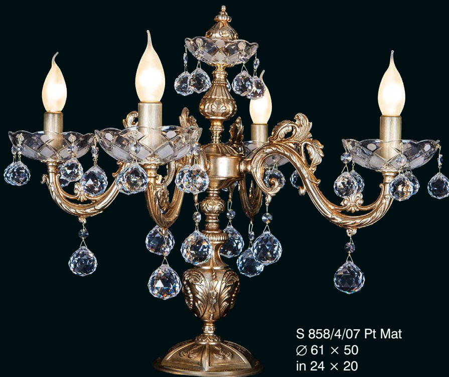
S 858/4/07 Pt Mat Ø 61 × 50 in 24 × 20