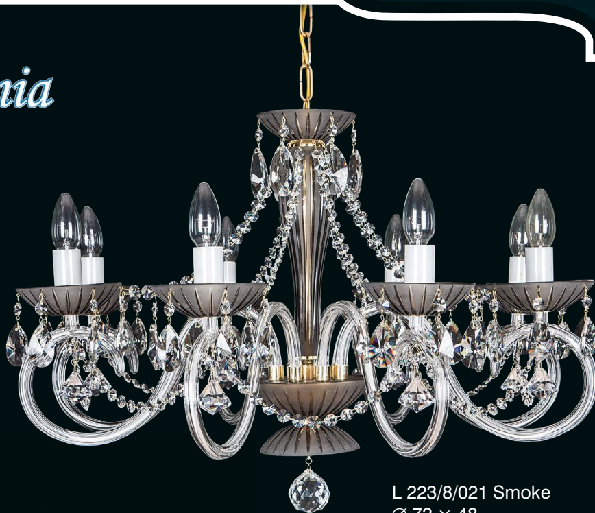
L 223/8/021 Smoke Ø 72 × 48 in 28 × 19