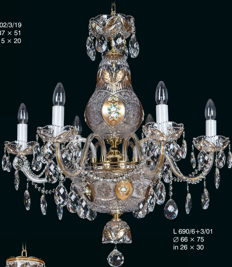
L 690/6+3/01 Ø 66 × 75 in 26 × 30