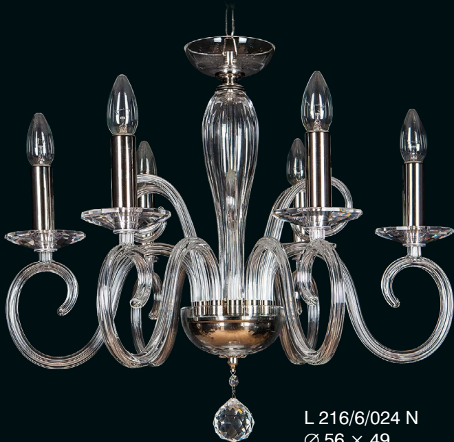
L 216/6/024 N Ø 56 × 49 in 22 × 19