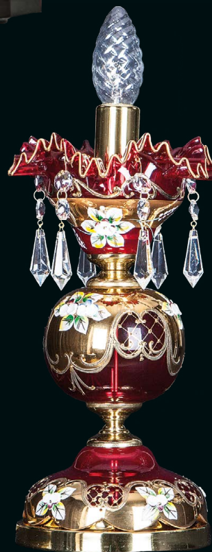
S 550/1/37 Ø 13 × 23 in 5 × 9