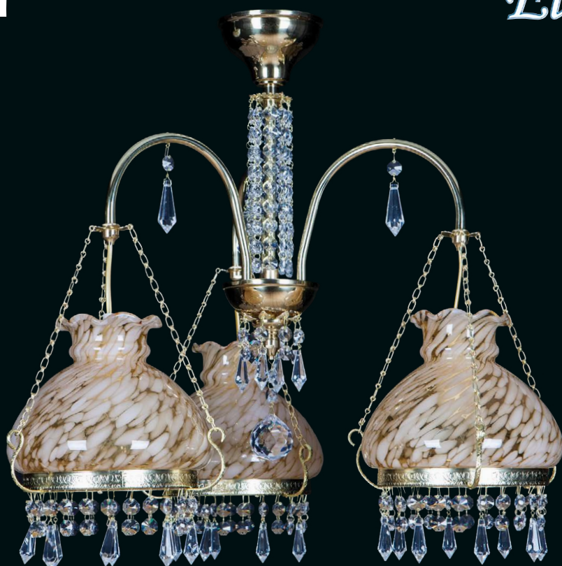
L 732/3/05 Ø 50 × 52 in 20 × 21